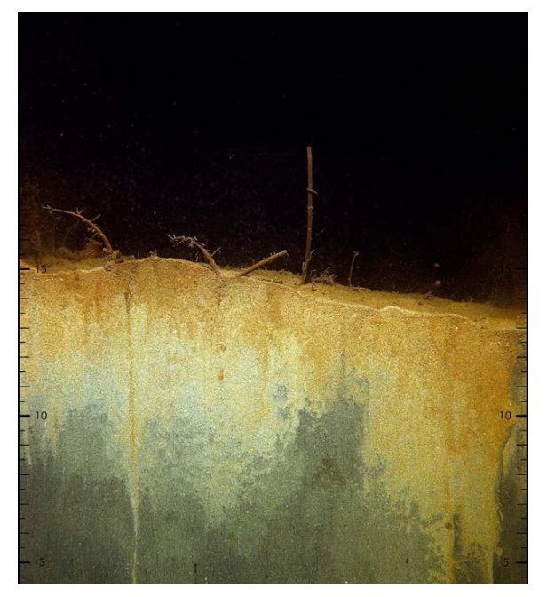
Fig. 1: A sediment profile image (SPI) from one of the most heavily polluted area in the Grenlandfjord area (Frierfjord). However, ecological the area is healthy with a rich benthic fauna.

decades. Introduction: During the last historically contaminated sediments have become challenge in environmental а management in coastal countries. The reason is that as industrial and municipal sources have decreased, contaminated sediments remain acting as a potential source for elevated concentration of contaminants in coastal water. In Norway, health advice has been issued on consumption of seafood from 32 fjords and coastal areas and ambitious plans for sediment remediation have been put forward.