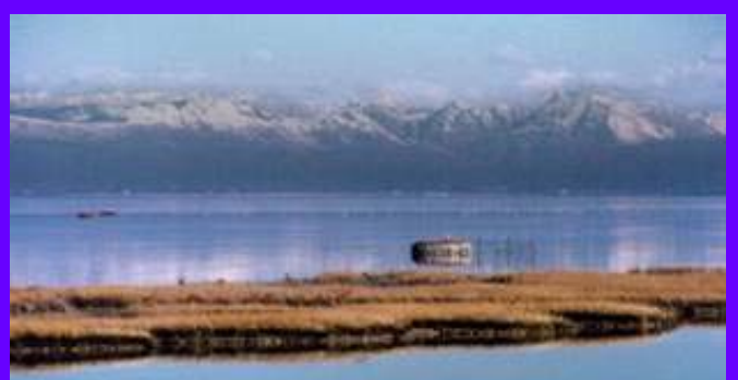
Lagoon of Venice, from RAMSAR Convention of Wetlands

Estimated economic value of tidal marshes is US$ 10,000/ha/yr (Costanza et al., 1997)