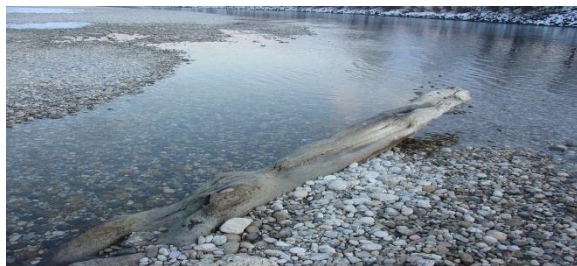
Fig. 1: Sava riverbed upstream of Zagreb during low water season in 2011.

Methods: Daily measurements of Sava River suspended sediment in Croatia has been taken at five location for more than 30 years, following standard filtration procedure (ISO 4365:2005). Results of daily concentration rates, daily, monthly and total amount of load transport rates are published in Hydrological yearbooks. Periodically, cross-sectional mean suspended sediment mass measurements, and mean particle size distribution (ISO 4363:2002) are conducted at three locations at urban part of Sava riverbed. Those data series represents the base for the empirical relations defined between different hydrological parameters. Nowadays, there is an intention of the Meteorological and Hydrological Service of Croatia to replace this traditional methodology with more efficient and less costly methodology. The new methodology of suspended load measurements is by using Acoustic Doppler Current Profiler (ADCP) measurements and special software for converting echo backscatter intensity to the concentration of suspended solid in water.