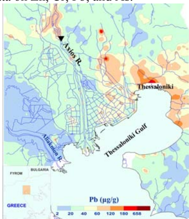
Fig. 1: Spatial distribution of Pb ( \mu\text{g/g} ) in active stream sediments of the Axios R. Note the decreasing Pb content southern of the Prochoma dam, indicated by a black triangle.

Methods: Active stream sediments were analyzed for a series of major, minor and trace elements by the Greek Institute of Geology and Mineral Exploration (in total 3237 samples; see [1] for details). Thirty-seven surface marine sediments were analyzed for major and minor elements at the laboratories of the Hellenic Centre for Marine Research [1, 3]. Here we report data on Zn, Cr, Pb, and As.