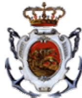
Venice Port Authority