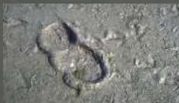
silt / mud