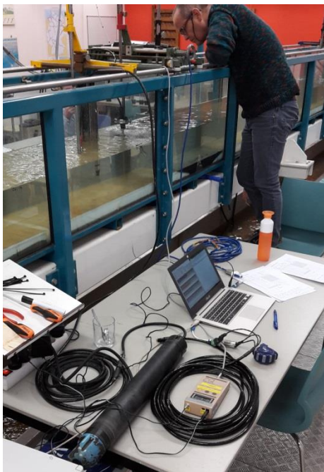
Fig. 1: Flume test set-up at Hanze University

Methods: Several experiments have been carried out in a laboratory flume, fig 1, (length of 10 meter and a width of 0,4 meter) at the Hanze University of Groningen (The Netherlands). The experiments were focussed on the recalibration of the Eromes-instrument and testing of mixtures of sand and mud in the flume and Eromes-instrument. The Eromes-instrument has been calibrated and used in several studies in Germany [2][3] for determination of the in-situ critical bed-shear stress. The flow velocities were measured with a three-dimensional instrument and mud concentration was measured with two different optical sensors. Experiments have been carried out with sands with different gradations and weakly consolidated muds at the bed at increasing flow velocities.