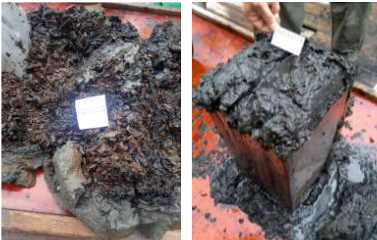
Two different types of fiberbanks