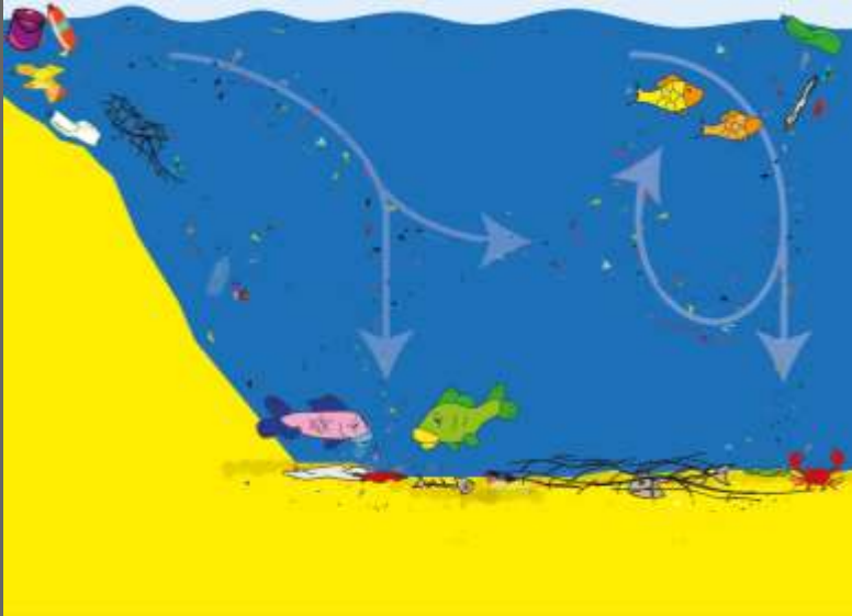
Estimated amounts of plastic in the ocean